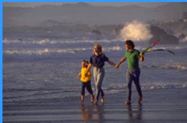
Enjoy Northern Michigan's shoreline with family walks.