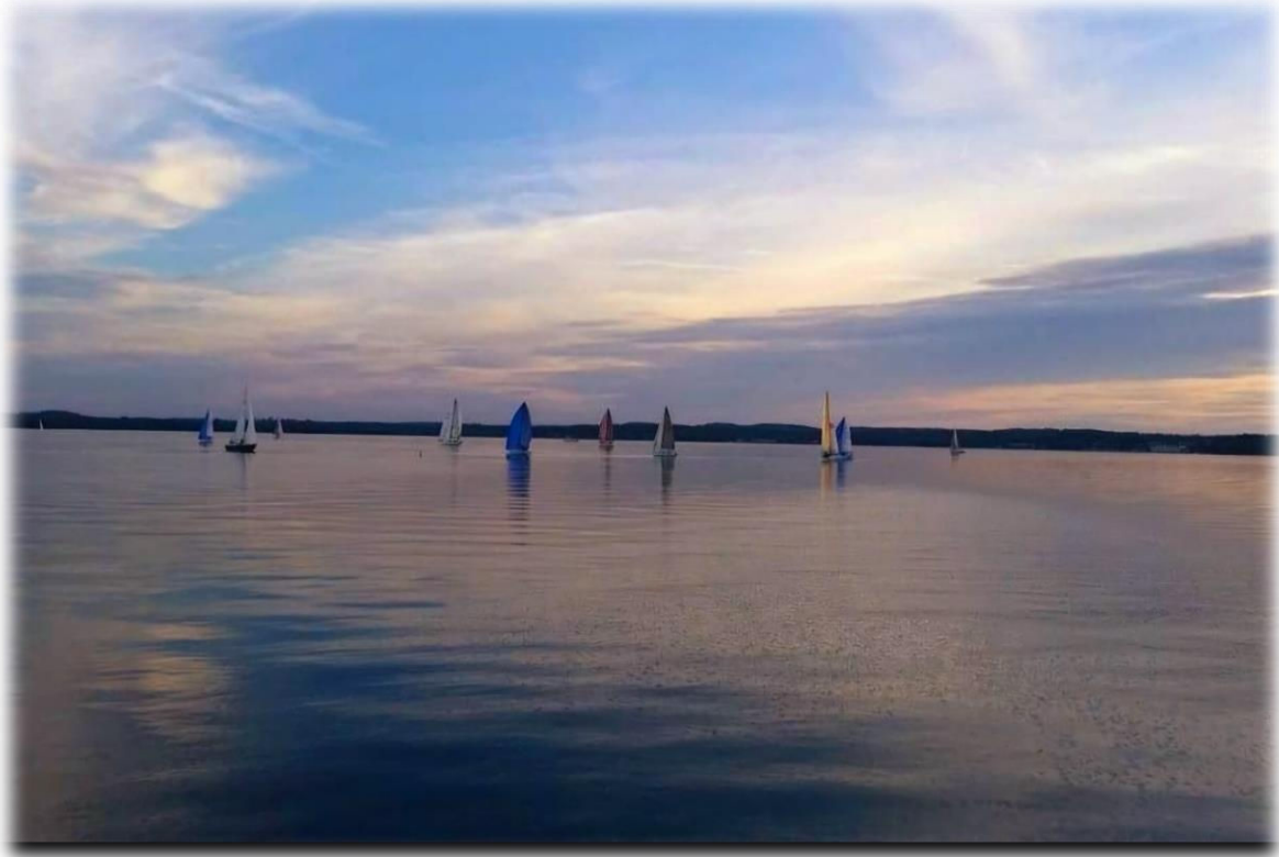
Round Lake on Lake Charlevoix